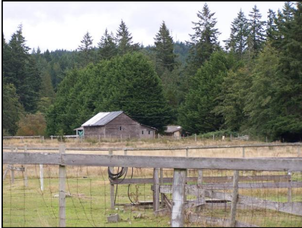
Figure 2. South Langford

Agriculture has and will continue to play a vital role in the social, environmental and economic well-being of Langford. Increasingly, food is becoming one of the most important issues to address due to its associations with human and environmental health and the economy, and its vulnerability in the face of rising energy costs and climate change. Access to safe, locally produced food and an emphasis on the environment, healthy eating and community involvement are key to long-term growth and sustainability of the agricultural and food sectors in Langford.