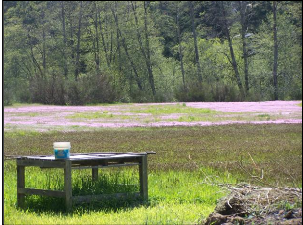
Figure 3. South Langford