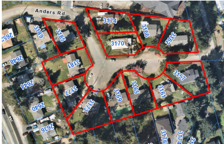
Figure 1: Anders Rd Parking Permit Request