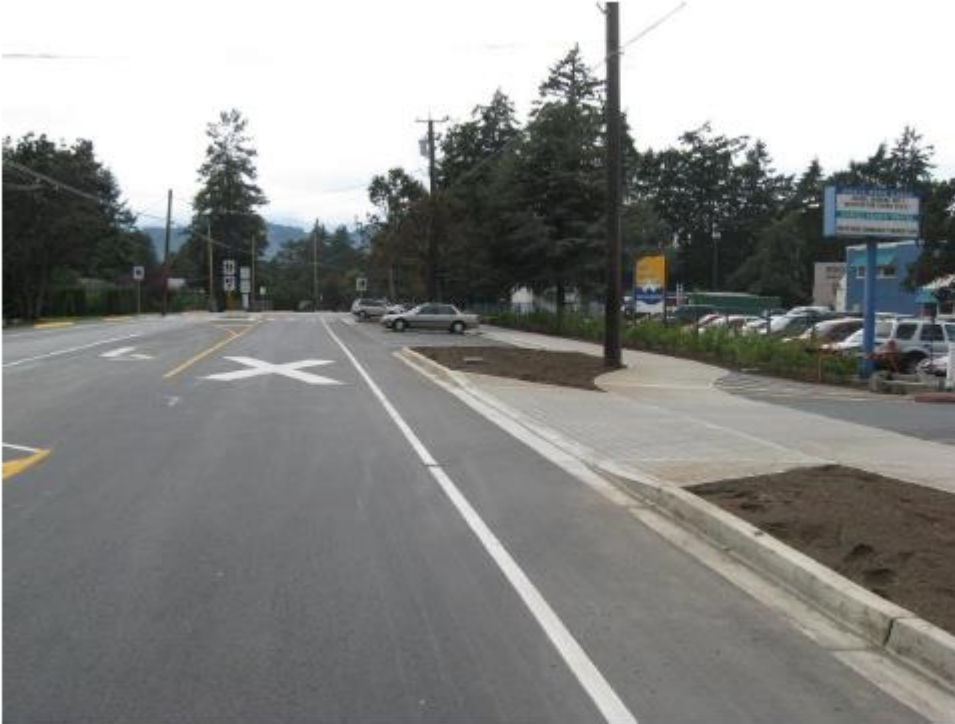
View looking west across the front of Spencer Middle School showing bicycle lane, sidewalk winding behind the parking, and properly marked turning lanes.

The purpose of this report is to seek direction on how best to manage the parking stalls in front of Spencer Middle School moving forward.